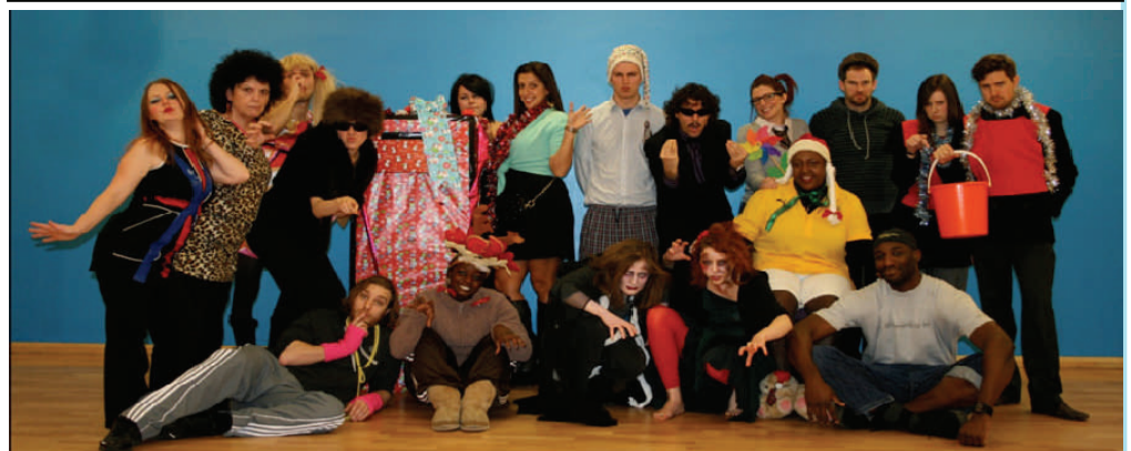
The cast of Scrooge

The Academy staff performed their version of the pantomime Scrooge on the last day of term. They completed two