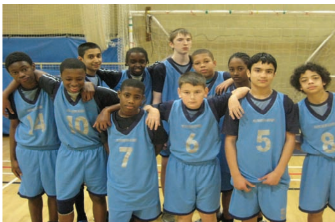
The Year 8 Basketball Team