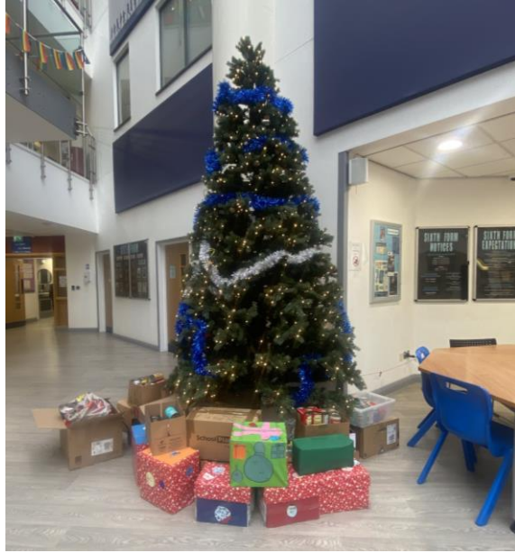
Christmas boxes for branches