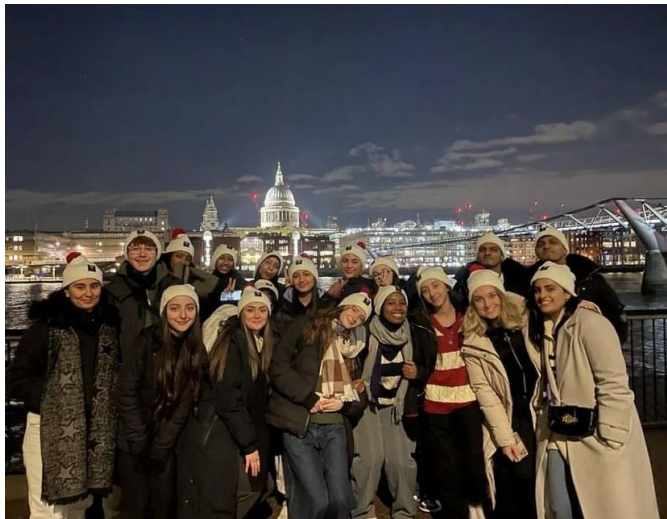
Sixth form sponsored walk for Shelter